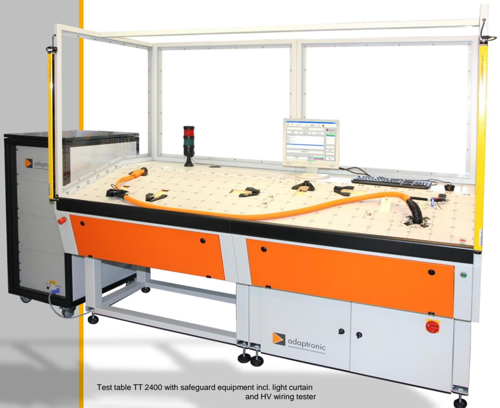
Test table TT 2400 with safeguard equipment incl. light curtain and HV wiring tester

© Copyright 2017, adaptronic Prüftechnik GmbH. All rights reserved. All mentioned features and functions are subjects to change. This document is only for information.