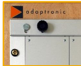
Carrier module locked