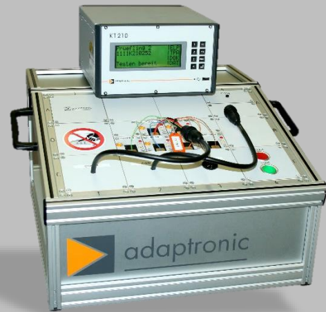
Test console PT 40 with wiring tester KT 210

You are looking for innovative system solutions for adapting and testing – then, you are right with us! a d a p t r o n i c Prüftechnik GmbH, Wertheim