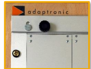
Carrier module released